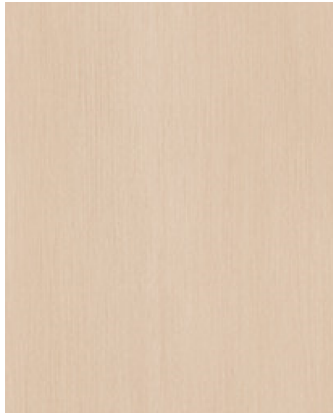
* PHANTOM ECRU 8212-60