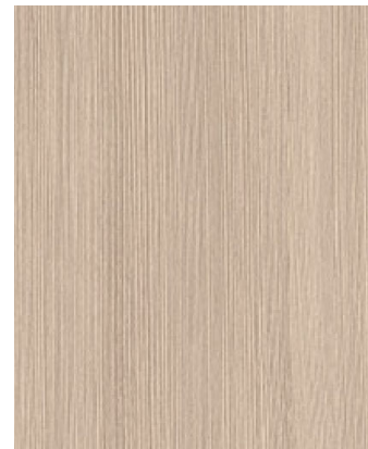
* HIGH LINE 7970-60