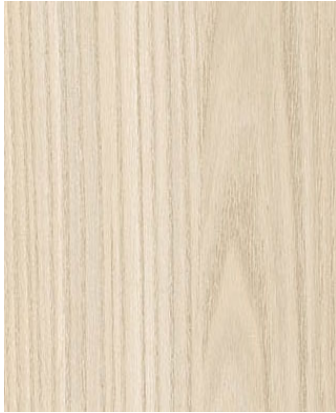
* FIELD ELM 7999-60